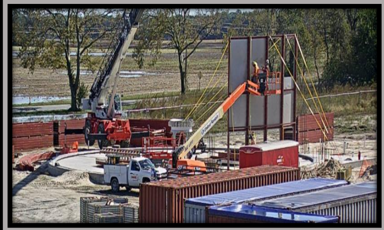
Laurel, DE on Oct. 11 and then Oct. 28, 2016

October has been all about going vertical. The walls of the Germination Kilning Vessels (GKVs) are rapidly coming together. There will be miles of welding to complete before we are through, and we are thankful that recent weather, although wet and rainy, did not cause any disruptions to our construction schedule. Our next step will be the construction of the steep tank, and the welding of those pieces. Barley bins are also going up! We are still on schedule for startup in the first quarter of 2017, ready to start shipping in spring!