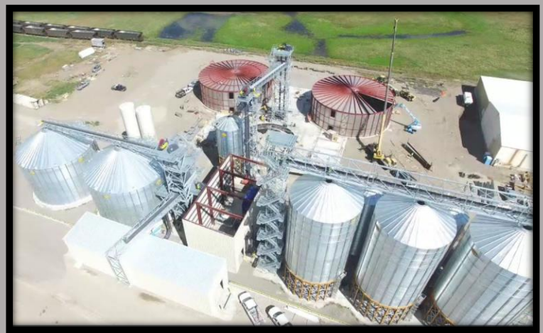
Colorado Progress Photos

Progress has been ongoing throughout the summer. Good weather has allowed the bins to be finished, conveyor installation is nearly complete and the steep tank is well underway. The next step will be construction of the building around the process vessels, shortly we will not be able to see the construction work going on from our remote camera, that has provided us with hours of entertainment from our computers. We are still on schedule and expect to be commissioning early in the new year, with shipments to start the second quarter of 2017.